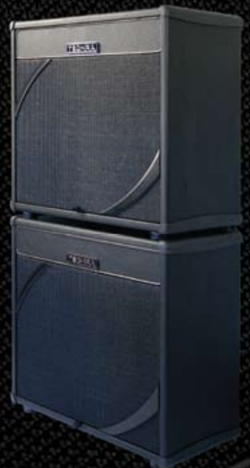
Passive cabinet (optional)